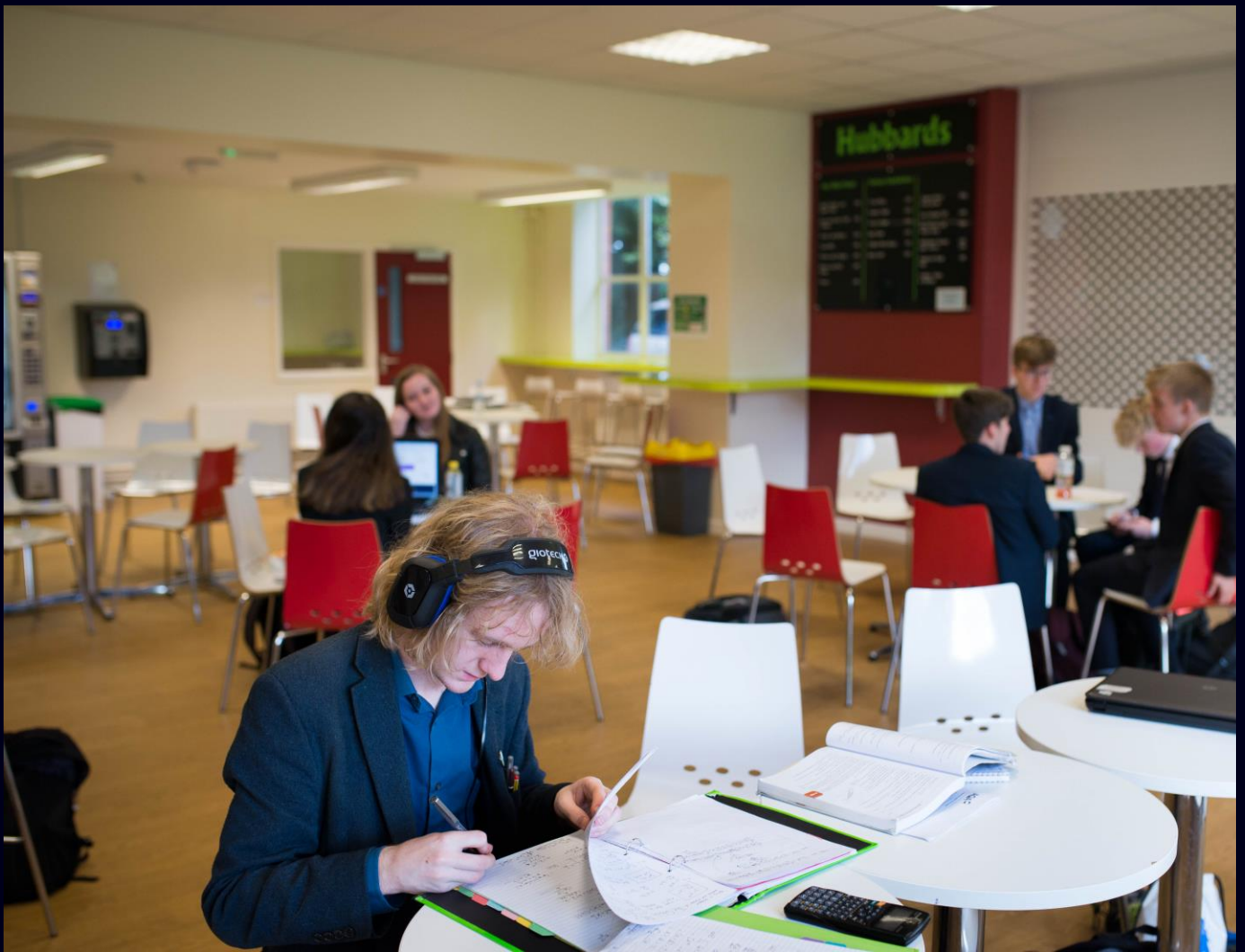
Norton Lodge, Sixth Form Centre. Helping students transition to independence.