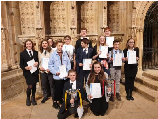
Go4Set Team at Lincoln Cathedral Receiving Awards in this STEM Challenge Competition

We are committed to encouraging all of our students to engage in these important, exciting and enjoyable aspects of our family.