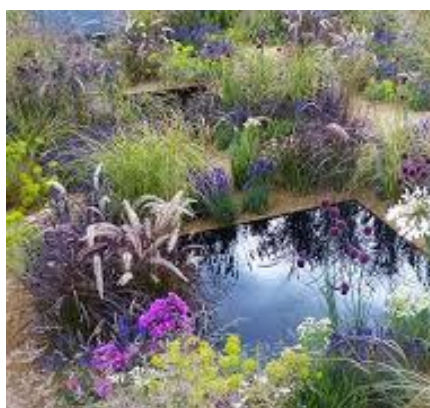
Example of ideas for the Sensory Garden in our new Wellness Centre.

So important is this part of our school life that we have not one but two Deputy Heads leading this important aspect of our school life. Together the Deputy Heads lead and manage a wealth of resources to support children's personal development and ongoing pastoral care. This includes our experienced SEND team; Learning Mentors; Counsellors; Teaching Assistants and Emotional Learning Support Assistants, and our dedicated Wellness and Spirituality curriculum team.